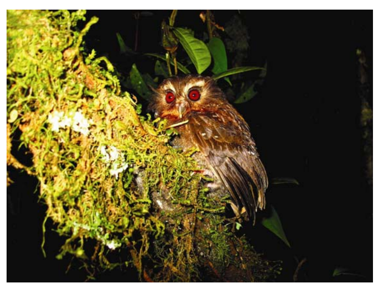
Long-whiskered Owlet, photo from ECOAN February 2007, Abra Patricia Reserve

In addition to the endangered Long-whiskered Owlet and Ochre-fronted Antpitta, other endemics include the endangered Royal Sunangel, the rare and poorly known Cinnamon-breasted Tody-Tyrant, and the endangered Ash-throated Antwren.