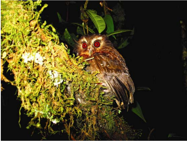
Long-whiskered Owlet, Abra Patricia Reserve

In addition to the endangered Long-whiskered Owlet and Ochre-fronted Antpitta, other endemics include the endangered Royal Sunangel, the rare and poorly known Cinnamon-breasted Tody-Tyrant, and the endangered Ash-throated Antwren.