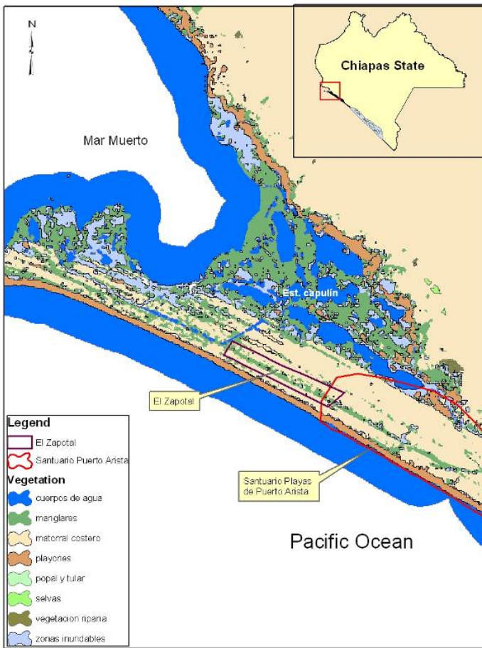
Figure 2. El Zapotal located near the large federal protected area. 370 acre tract