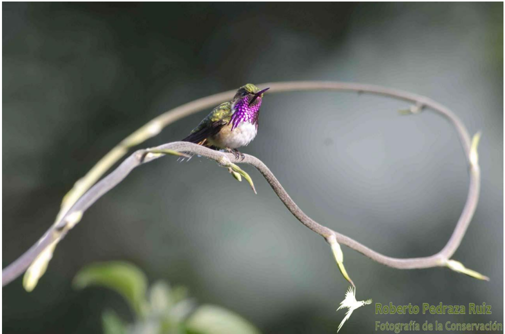
Bumblebee Hummingbird – a rare resident