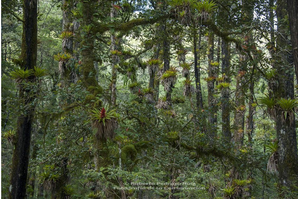
Old growth cedars with a healthy bromeliad community