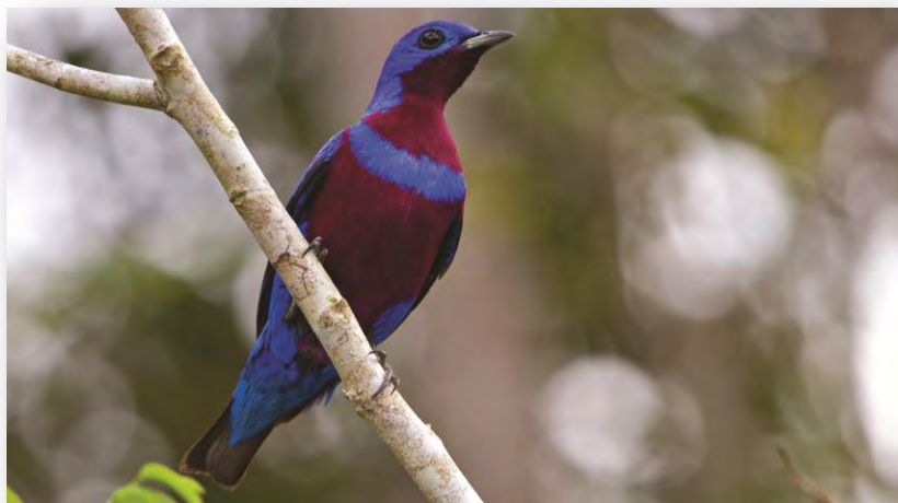
Banded Cotinga