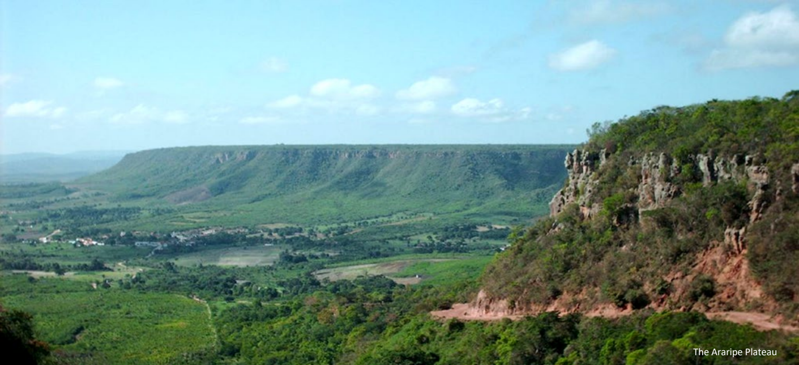
The Araripe Plateau