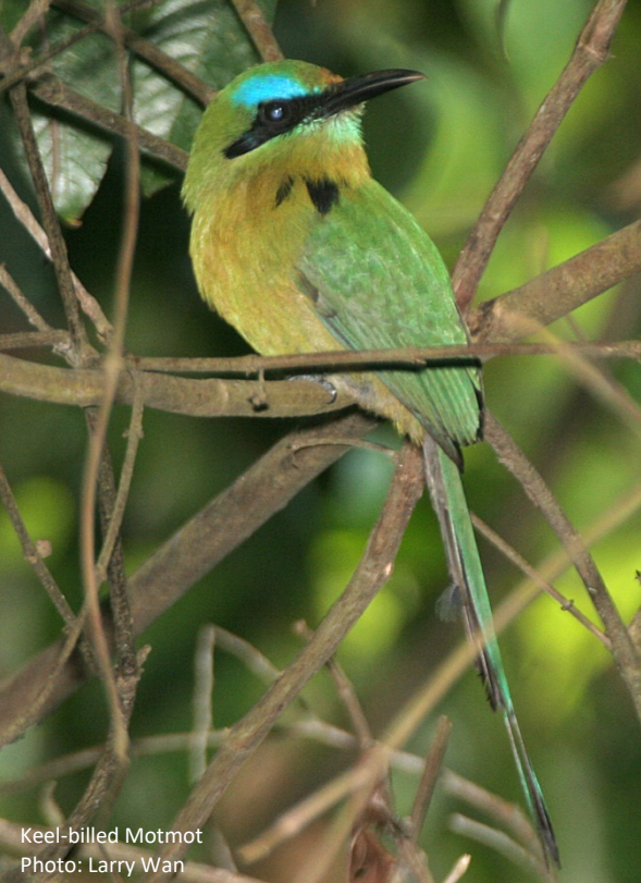
Keel-billed Motmot