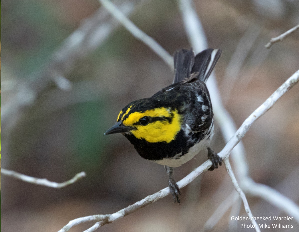
Golden-cheeked Warbler