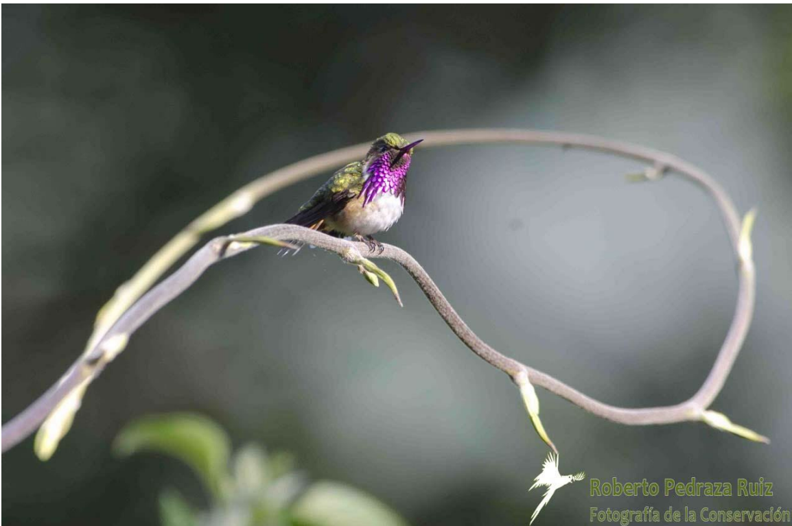
Bumblebee Hummingbird – a rare resident