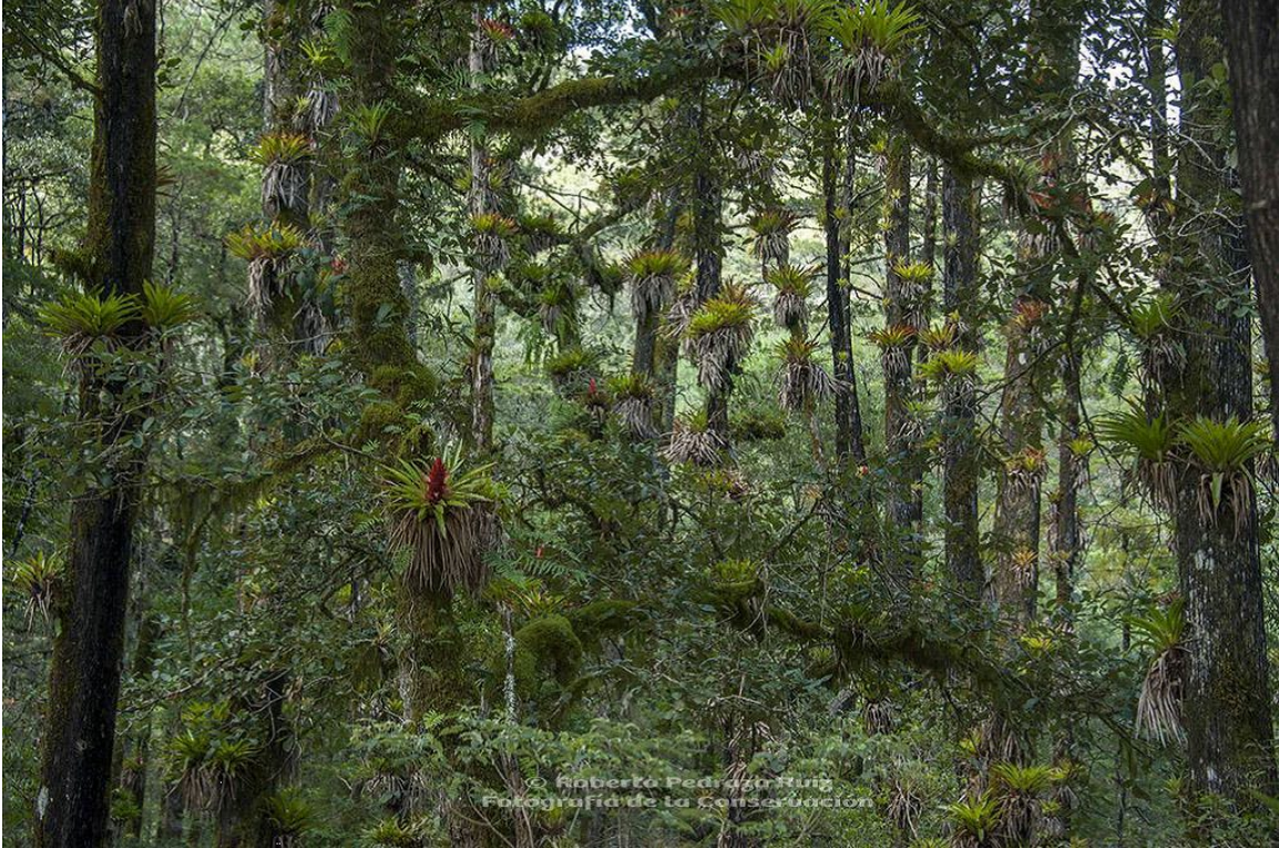
Old growth cedars with a healthy bromeliad community