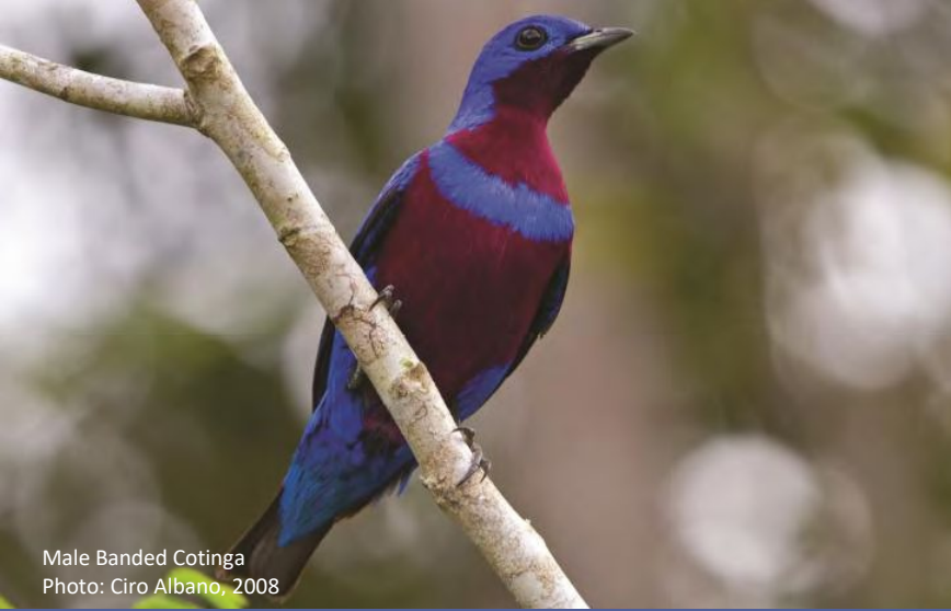
Male Banded Cotinga