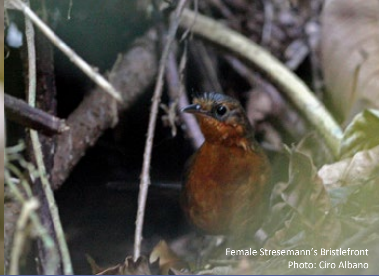
Female Stresemann's Bristlefront